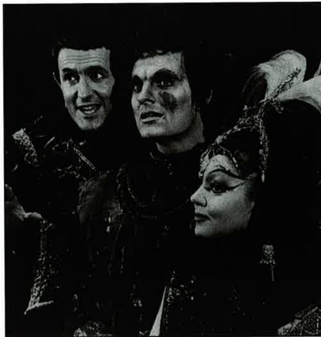
Alan Alda (center) in a stage production not long before he gave up his goal of becoming a classical actor.

York, Alda came to painfully understand why his father hadn't encouraged him to go into show business. During one lean period, Phil Silvers, and old friend from the burlesque circuit, helped him get a part in an "awful" off-Broadway revue. Eventually, he did land decent off-Broadway, then Broadway, and finally television parts (he was a regular on That Was The Week That Was ). Married at 21 and a father not long after, Alda was 29 before he realized that Oedipus probably wasn't in the cards. It dawned on him, dramatically enough, right in the middle of a musical in Boston called The Apple Tree , directed by Mike Nichols. Alda